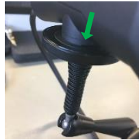
Make sure probe head is fully inserted and seated into holder