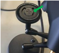
Insert / remove probe

The FireFly® probe holders consist of insulating material. Only the holder FF-HAL10kV, which is equipped with the 3D probes positioner FF-3DPOS200, provides isolation voltages up to 10kV. Observe the required distances of FireFly® probe head to earth ground.