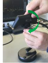
Twist by 90° to mount or unmount